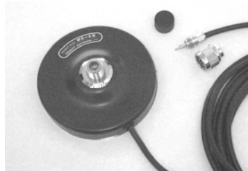
MG-4N Magnetic mount