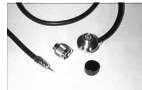
5D4N Hole mount