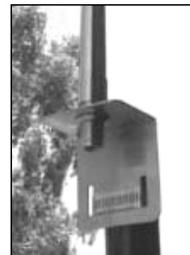
MB-100 Mast mount