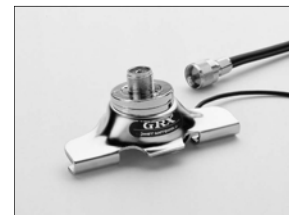
GR-5N Mobile trunk lip mount